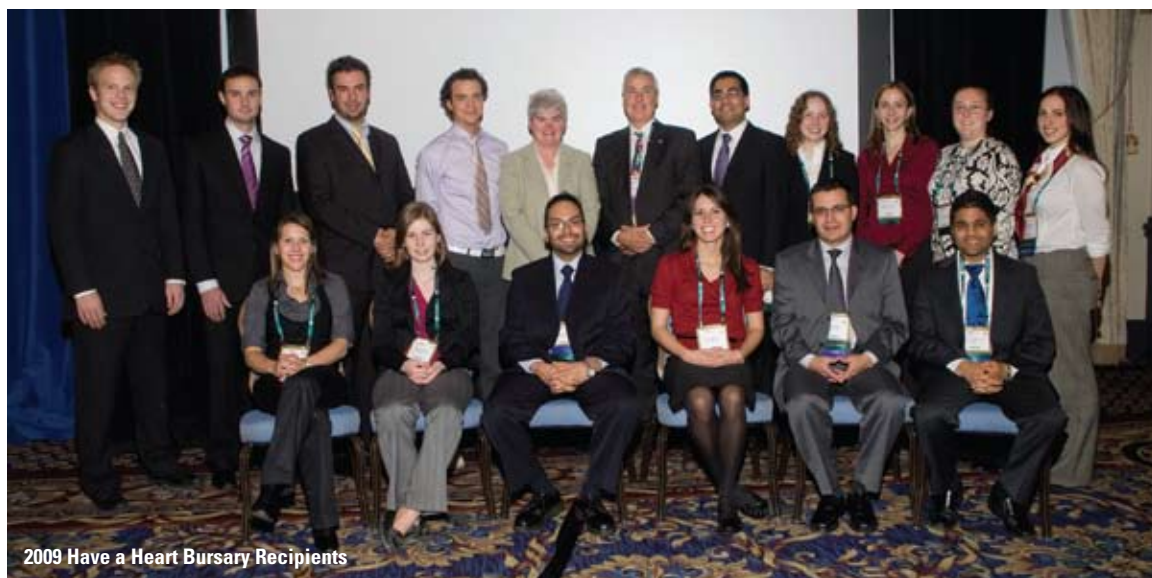
2009 Have a Heart Bursary Recipients

Make the CCSA part of your planned giving! Learn about ways to donate the CCSA at: www.ccs.ca/ccsa .