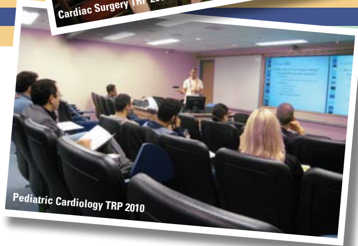
Pediatric Cardiology TRP 2010

Since its inception in 2002, the Have a Heart Bursary Program has funded more than 100 young individuals.