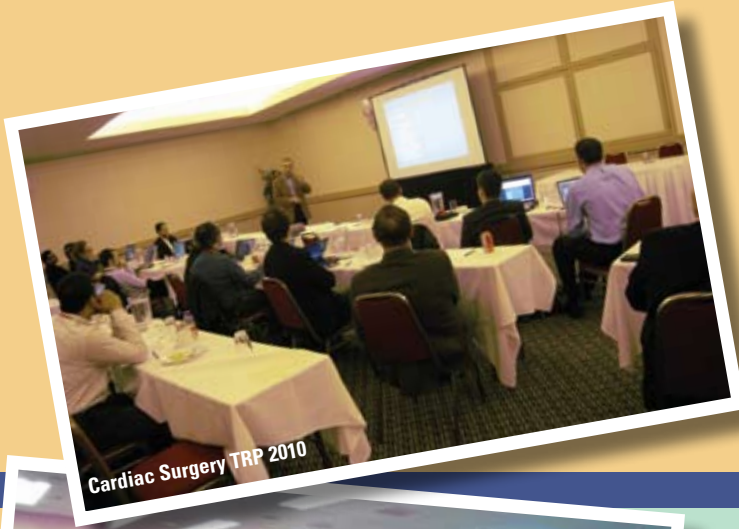
Cardiac Surgery TRP 2010

The 'Have a Heart' Bursary program is a travel bursary program designed to introduce promising young Canadian medical students, post-graduate trainees, and basic scientists in training to the cardiovascular field in Canada. This program supports 15 to 20 students annually to participate at the Canadian Cardiovascular Congress, and introduces them to accomplished members of the cardiovascular community.