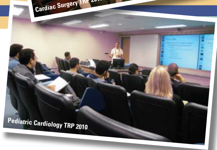
Pediatric Cardiology TRP 2010

Since its inception in 2002, the Have a Heart Bursary Program has funded more than 100 young individuals.