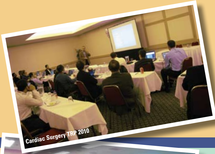
Cardiac Surgery TRP 2010

The 'Have a Heart' Bursary program is a travel bursary program designed to introduce promising young Canadian medical students, post-graduate trainees, and basic scientists in training to the cardiovascular field in Canada. This program supports 15 to 20 students annually to participate at the Canadian Cardiovascular Congress, and introduces them to accomplished members of the cardiovascular community.