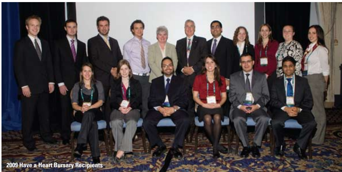
2009 Have a Heart Bursary Recipients

Make the CCSA part of your planned giving! Learn about ways to donate the CCSA at: www.ccs.ca/ccsa .