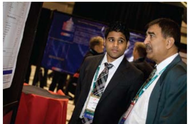
Have a Heart Bursary Program