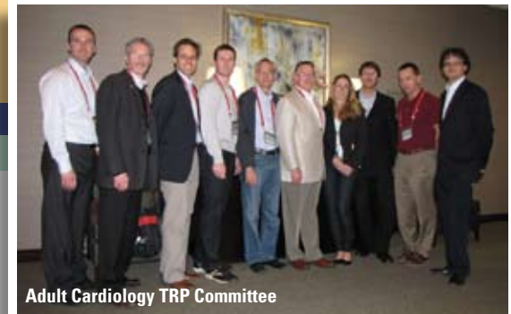
Adult Cardiology TRP Committee

Donations from individuals and organizations provide the necessary funding to develop new and expand existing valued CCSA programs.